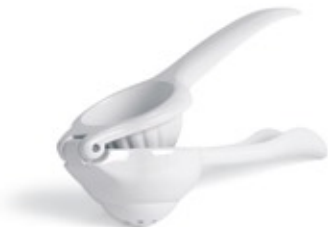
CITRUS PRESS 2595

Master Scraper 1703, Mega Scraper 1701, Micro Scraper 1702, Classic Scraper 1650