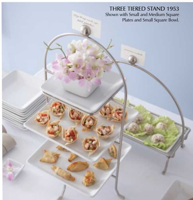
THREE TIERED STAND 1953 Shown with Small and Medium Square Plates and Small Square Bowl.