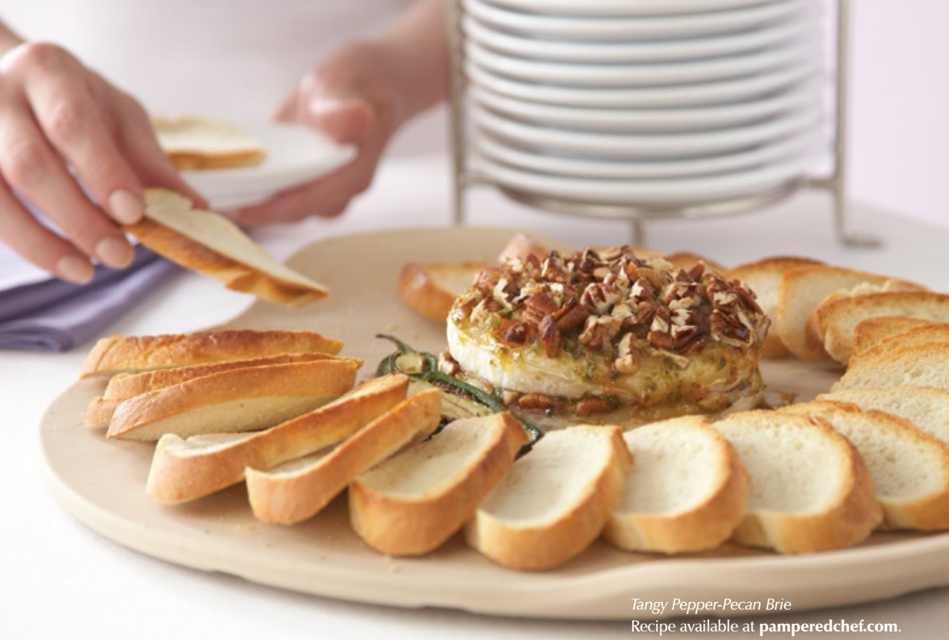
Tangy Pepper-Pecan Brie Recipe available at pamperedchef.com .