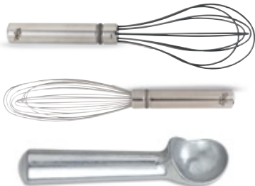
STAINLESS/SILICONE SAUCE WHISK 2481