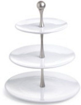
ADJUSTABLE TIERED TOWER 1956

TIP Keep any occasion fresh and exciting with our fun assortment of Simple Additions® pieces. Set a playful table that's perfect for everyday use. Or, be creative and nest two bowls to serve fresh berries and yogurt at brunch. It's sure to impress your friends and family.