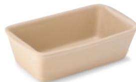
STONEWARE LOAF PAN 1417