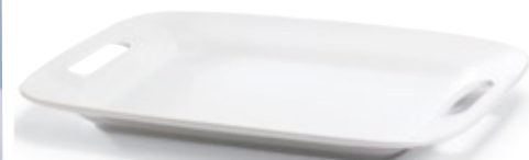
LARGE RECTANGULAR PLATTER WITH HANDLES 2026