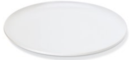
LARGE ROUND PLATTER 2034