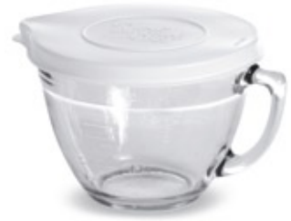
CLASSIC BATTER BOWL 2230 Small Batter Bowl 2233