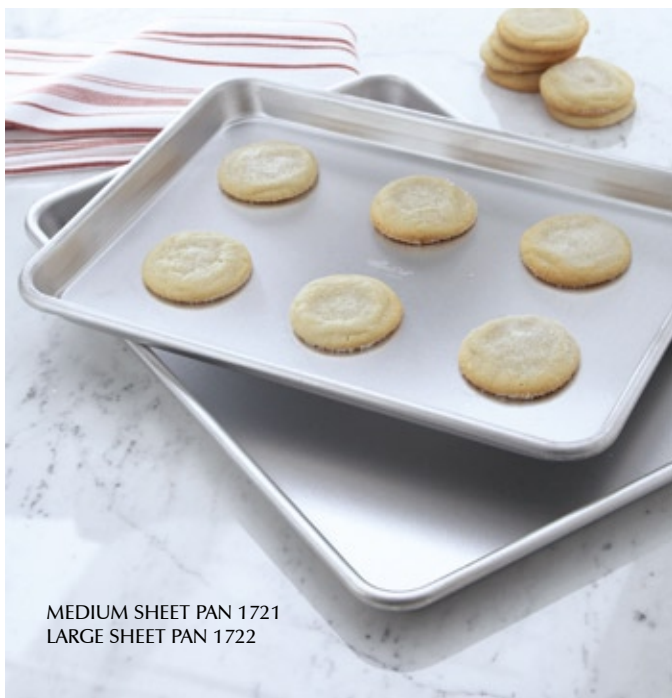
MEDIUM SHEET PAN 1721 LARGE SHEET PAN 1722