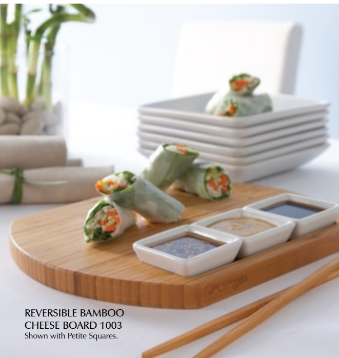
REVERSIBLE BAMBOO CHEESE BOARD 1003 Shown with Petite Squares.