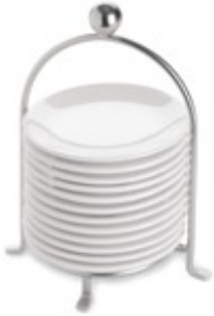
APPETIZER PLATES & CADDY SET 2061

TIP Keep any occasion fresh and exciting with our fun assortment of Simple Additions® pieces. Set a playful table that's perfect for everyday use. Or, be creative and nest two bowls to serve fresh berries and yogurt at brunch. It's sure to impress your friends and family.