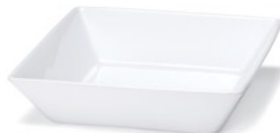
LARGE SQUARE BOWL 1935