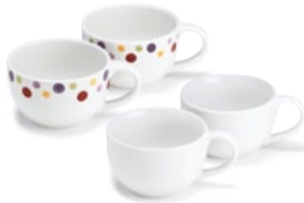
DOTS COFFEE & MORE CUPS 1977 COFFEE & MORE CUPS 1976