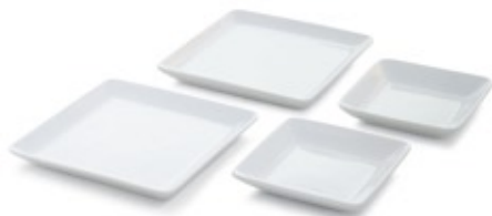
MEDIUM SQUARE PLATES 1930 SMALL SQUARE PLATES 1925