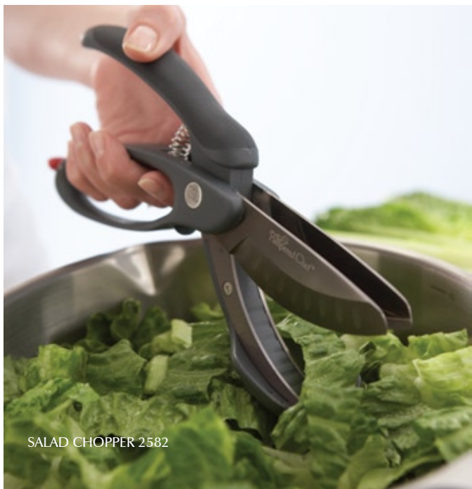
SALAD CHOPPER 2582