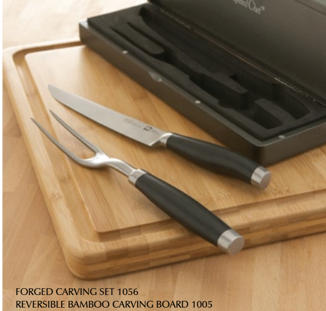
FORGED CARVING SET 1056 REVERSIBLE BAMBOO CARVING BOARD 1005