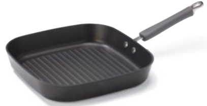
11" SQUARE GRILL PAN 2868 GRILL PRESS 2875