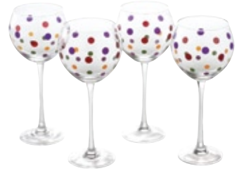
DOTS STEMWARE 2833