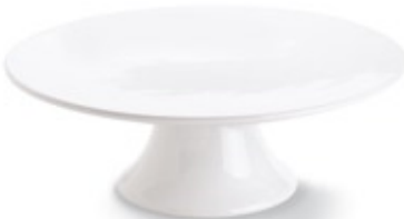
CAKE PEDESTAL 1957