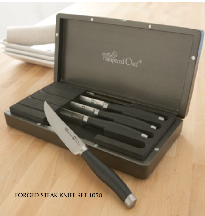
FORGED STEAK KNIFE SET 1058