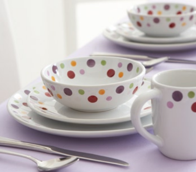
DOTS 16-PIECE DINNERWARE SET 2079 Includes four place settings: Dots Cups, Dots Small Round Bowls, Dots Salad Plates and Dots Dinner Plates.