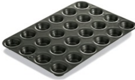
DELUXE MINI-MUFFIN PAN 1606