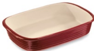
RECTANGULAR BAKER 1338

Our collection delivers exceptional results by evenly distributing heat and drawing moisture away from the surface. It's ideal for crispy pizza crusts, flaky pies, juicy roasts and tender chickens. Each piece is microwave-, freezer-, and conventional and convection oven-safe.