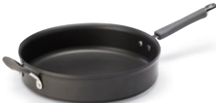
12" SKILLET 2865