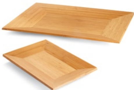
LARGE BAMBOO PLATTER 2252 MEDIUM BAMBOO PLATTER 2251

TIP Carry a single, simple theme throughout your parties to make them feel polished and elegant. For an Asian-theme dinner party, decorate the table with delicate orchids, include chopsticks at each place setting, and add bamboo serving pieces and accents to set the tone.