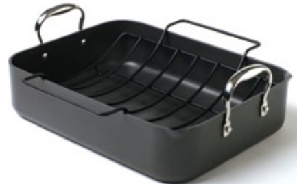
ROASTING PAN WITH RACK 2872