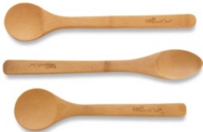
BAMBOO SPOON SET 1674