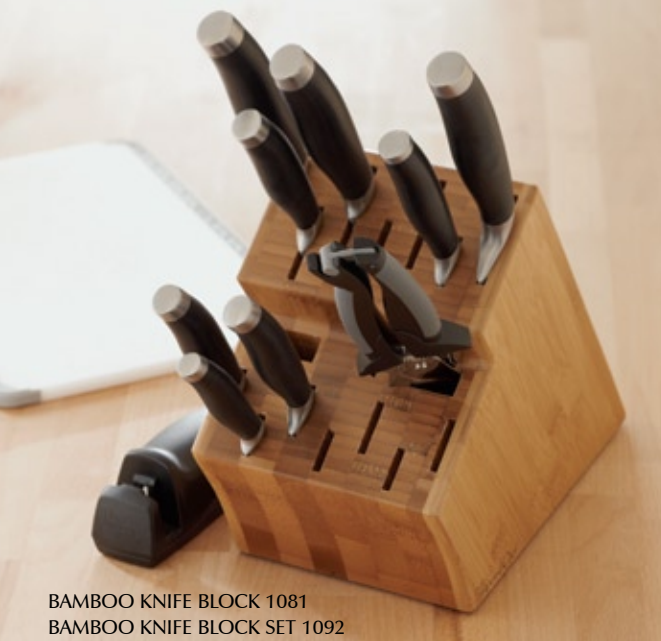
BAMBOO KNIFE BLOCK 1081 BAMBOO KNIFE BLOCK SET 1092