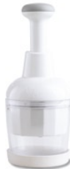
FOOD CHOPPER 2585

Using the right kitchen tools can make prep work quick and easy. Our tools feature durable construction — like stainless steel, eco-friendly bamboo and flexible silicone — so you can rely on them time after time.