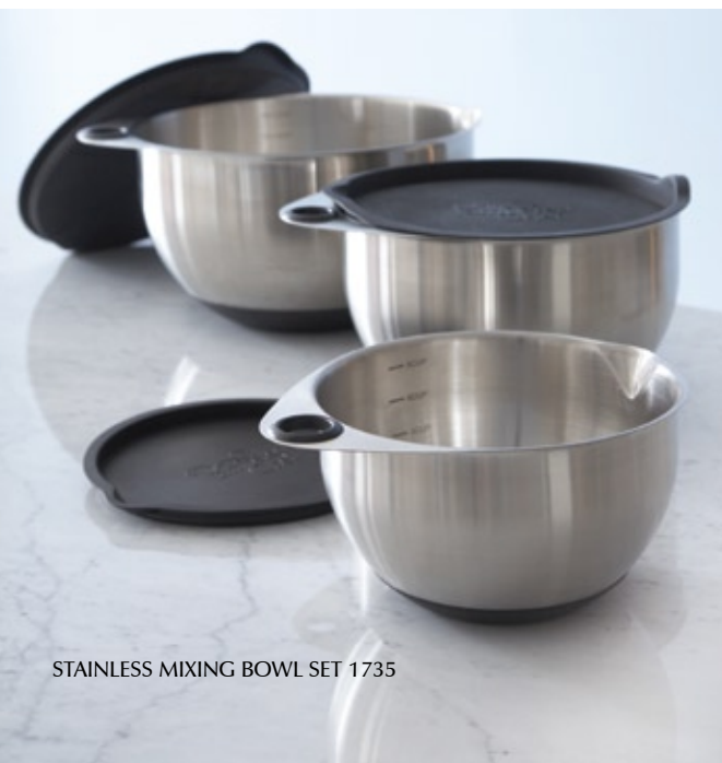
STAINLESS MIXING BOWL SET 1735