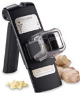
MICROPLANE® ADJUSTABLE FINE GRATER 1105