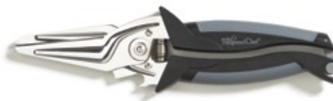
PROFESSIONAL SHEARS 1088