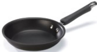
8" SAUTÉ PAN 2863