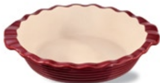
DEEP DISH PIE PLATE 1332