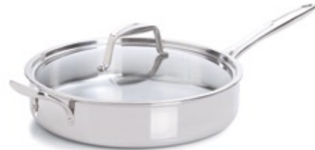
12" COVERED SKILLET 2885

Buying cookware is all about preference. Consider your cooking needs and choose a primary cookware collection. Start with a set and then supplement it with important open stock pieces, so you'll have the best of both worlds.