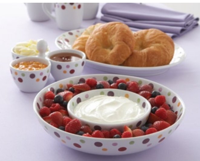
DOTS MEDIUM ROUND BOWL 2084 DOTS SMALL ROUND BOWLS (set of two) 2054 DOTS OVAL PLATTER 2083 DOTS BOWL TRIO 2078