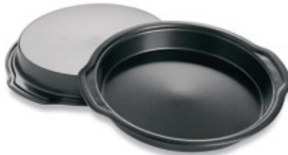
CAKE PAN SET 1707