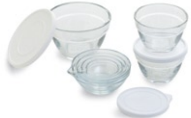
PINCH BOWL SET 1741 1-CUP PREP BOWL SET (set of six) 1825 2-CUP PREP BOWL SET (set of two) 1742

Put a new spin on old-fashioned favorites with modern bakeware. Ours feature silicone for beautifully detailed cakes, professional-quality aluminized steel for perfect browning, and exclusive nonstick coatings to ensure foods slip right out.