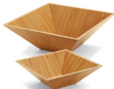
LARGE BAMBOO SQUARE BOWL 2254 MEDIUM BAMBOO SQUARE BOWL 2249

TIP Carry a single, simple theme throughout your parties to make them feel polished and elegant. For an Asian-theme dinner party, decorate the table with delicate orchids, include chopsticks at each place setting, and add bamboo serving pieces and accents to set the tone.