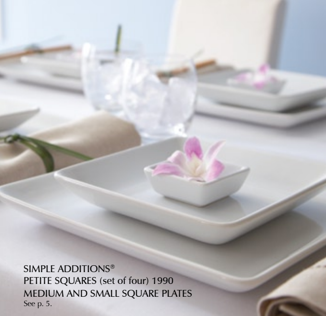
SIMPLE ADDITIONS® PETITE SQUARES (set of four) 1990 MEDIUM AND SMALL SQUARE PLATES See p. 5.