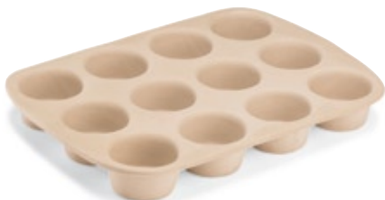
12-CUP MUFFIN PAN 1465