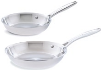
8" SAUTÉ PAN 2879 10" SAUTÉ PAN 2887