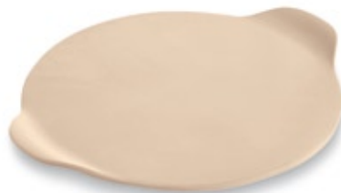
LARGE ROUND STONE WITH HANDLES 1371