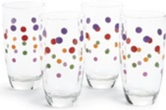
DOTS LARGE BEVERAGE GLASSES 2287