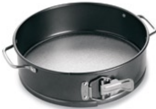
SPRINGFORM PAN 1542