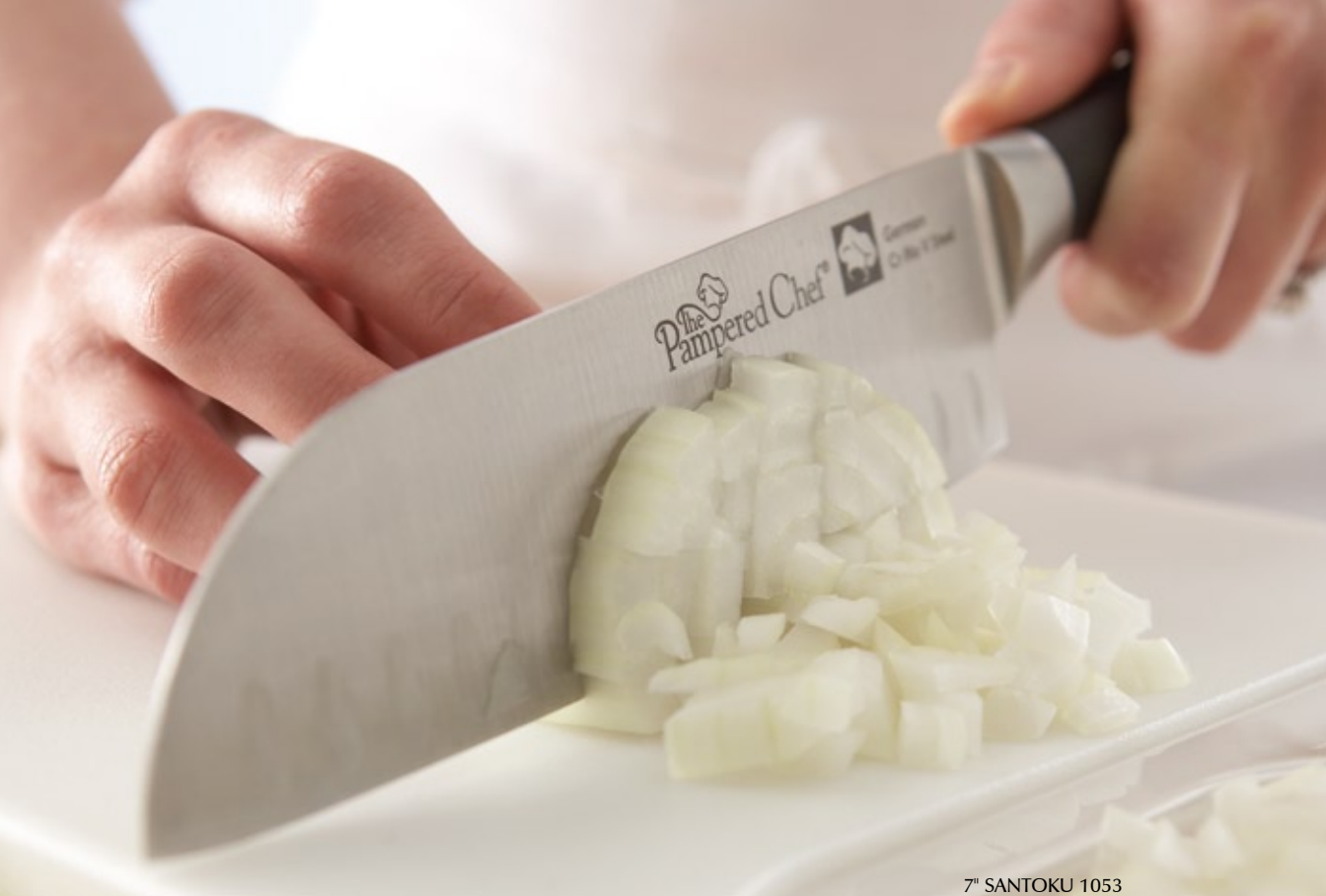
7" SANTOKU 1053