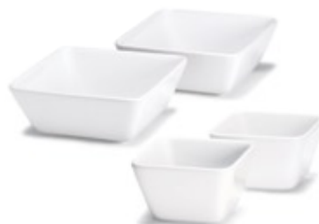
MEDIUM SQUARE BOWLS 1915 SMALL SQUARE BOWLS 1910