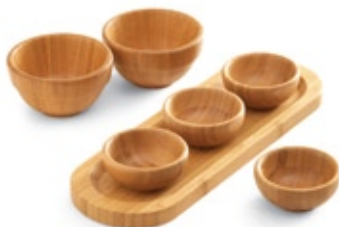
BAMBOO SMALL SNACK BOWLS 2296 BAMBOO PETITE SNACK BOWLS 2253 BAMBOO CRACKER TRAY 2247