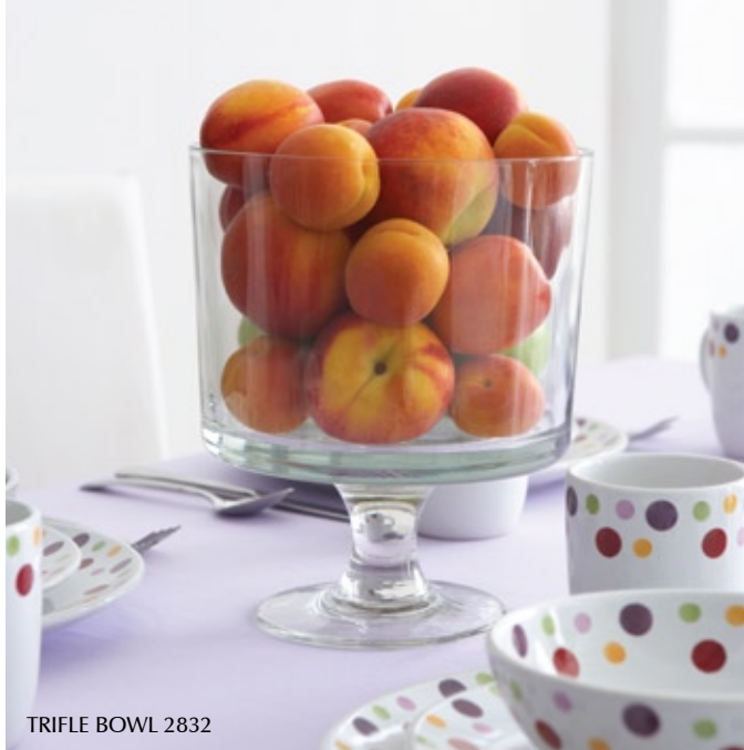
TRIFLE BOWL 2832