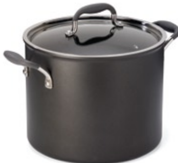
12-QT. STOCKPOT 2873