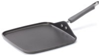
11" SQUARE GRIDDLE 2874