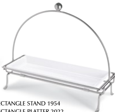
RECTANGLE STAND 1954 RECTANGLE PLATTER 2022