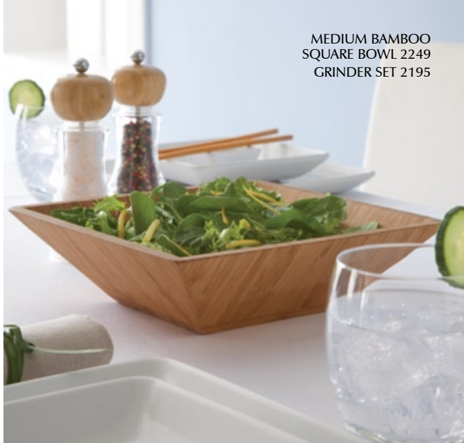
MEDIUM BAMBOO SQUARE BOWL 2249 GRINDER SET 2195