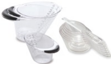
EASY READ MEASURING CUPS 2175 MEASURING CUP SET 2257