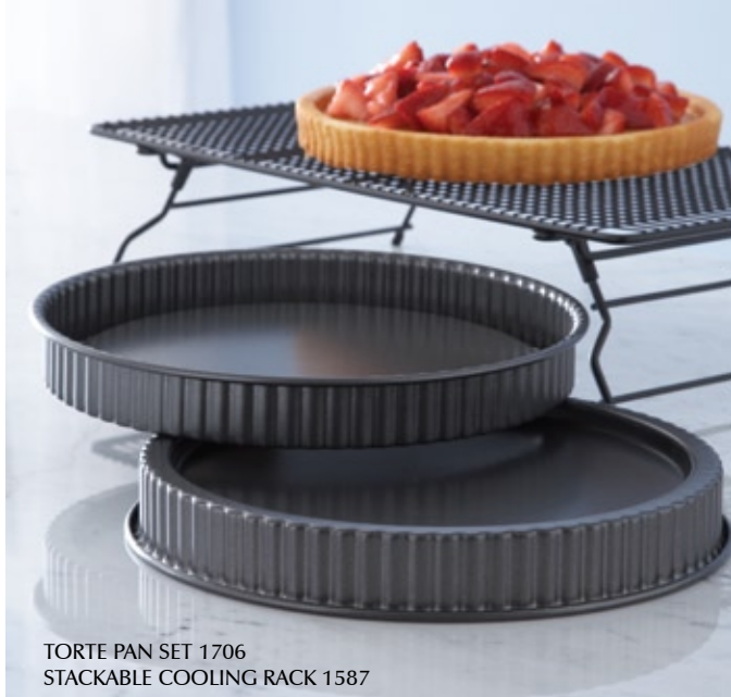
TORTE PAN SET 1706 STACKABLE COOLING RACK 1587