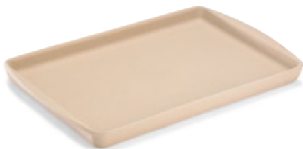
LARGE BAR PAN 1445