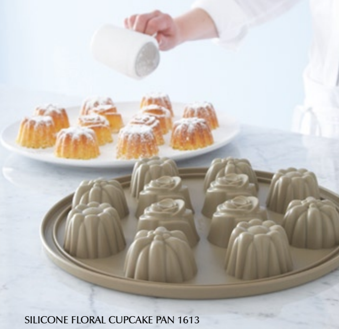
SILICONE FLORAL CUPCAKE PAN 1613