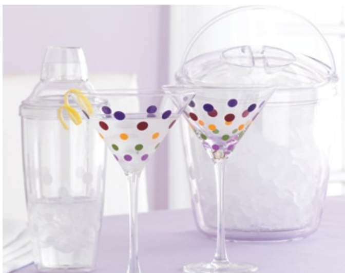
ICE BUCKET & SHAKER SET 2284 DOTS MARTINI GLASSES (set of four) 2838