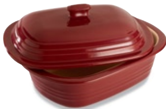
DEEP COVERED BAKER 1321