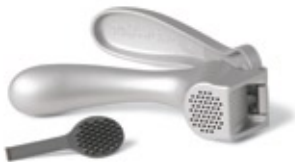
GARLIC PRESS 2576