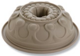
SILICONE CROWN CAKE PAN 1614