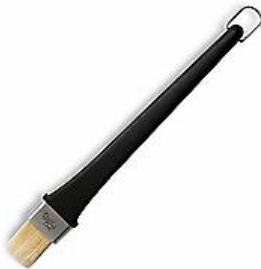
BBQ Basting Brush