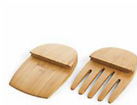
Bamboo Salad Claws $15.00

Perfect size for tossing and serving salads. Stain-, crack- and warp-resistant.