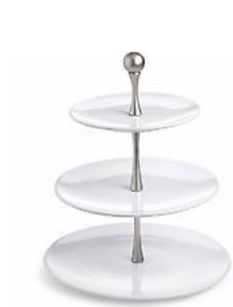
Adjustable Tiered Tower $39.50

Tower can be adjusted four different ways. Satin nickel finish. Disassembles easily for cleaning and storage. Plates are dishwasher safe!