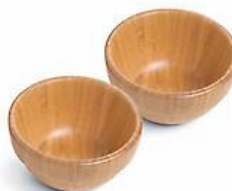
Bamboo Small Snack Bowls (set of 2) $18.50

Perfect size for tossing and serving salads. Stain-, crack- and warp-resistant.