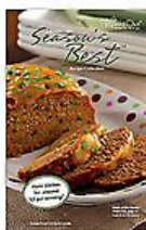
Season's Best Recipes F/W '09