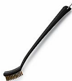
Grill Cleaning Brush