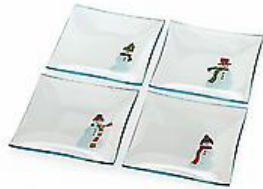
Set of 4 Snowmen Appetizer Plates

These items will be discontinued as of February 28, 2010. Quantities are limited and once they're gone, they're gone! Get yours today before it's too late!