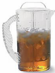
Family-Size Quick-Stir Pitcher