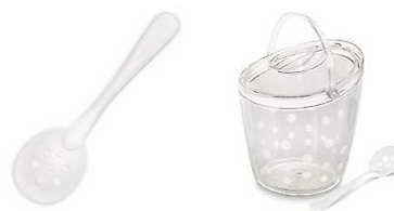
Ice Scoop $5.00 Ice Bucket & Scoop Set $34 Save $3 when purchased as a set!

Holes allow water to drain away from ice so your beverages get cool without being watered down.