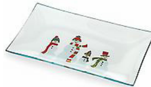
Snowmen Rectangle Platter