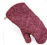
#1329 - $14.50 * Oven Mitt

Want it? Can't afford it? Host a show! Get it FREE!