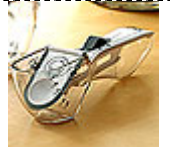
#2229 - $12.00 * Easy Adj. Measuring Spoon