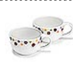
#1977 - $20.00 Dots Coffee & More Cups(2)