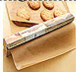
#1506 - $7.25 * Parchment Paper