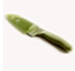
#1059 - $16.00 Color Coated Santoku Knife