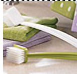
#1628 - $8.50 * Easy Clean Kitchen Brush