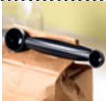
#2555 - $5.00 Scoop Clip