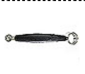
#1176 - $10.50 * Core & More