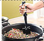
#2583 - $9.00 Mix 'N Chop