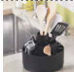
#2171 - $17.00 * Tool Turnabout