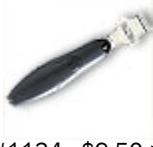
#1134 - $9.50 * Zester/Scorer