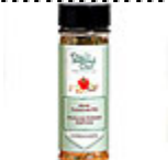
#9860 - $5.75 * Asian Seasoning Mix

Want it? Can't afford it? Host a show! Get it FREE!