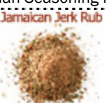
#9812 - $3.75 Jamaican Jerk Rub