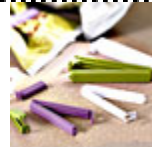
#2649 - $4.75 * Twixit! Clip Combo Pack