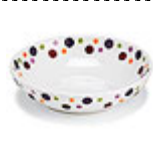
#2037 - $12.00 Dots Small Round Bowl