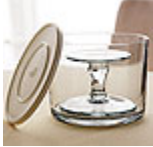
#2832 - $39.00 Trifle Bowl