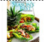
#1886 - $1.00 * Season's Best Recipe Coll.