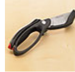
#2582 - $25.00 Salad Chopper