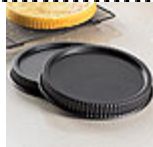
#1706 - $25.00 Torte Pan Set