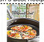
#1887 - $1.00 * Una Muestra de TPC