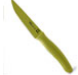
#1064 - $14.00 Color Coated Tomato Knife