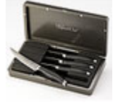
#1058 - $145.00 Forged Cutlery Stk Knife Set