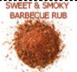
#9722 - $3.75 Sweet & Smoky BBQ Rub