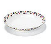
#2033 - $39.00 Dots Large Round Bowl