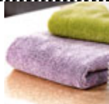
#2983/4 - $8.50 ea * Microfiber Towel