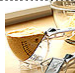
#2228 - $15.50 * Easy Adj. Measuring Cup