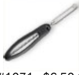
#1071 - $6.50 * Vegetable Peeler