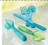
#2827 - $15.00 Outdoor Utensil Set