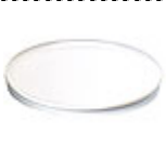
# 2034 - $38.00 Large Round Platter