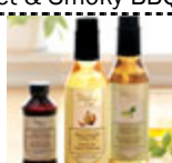
#9151 - $10.50 Garlic-Infused Canola Oil