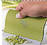
#1617 - $6.00 * Handy Scraper