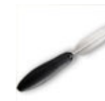
#1161 - $9.50 * V-shaped Cutter