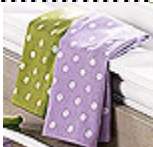
#2979 - $15.00 * Dots Towel Set (of 2)