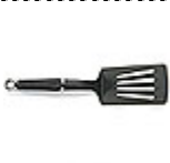
#2347 - $11.00 Small Slotted Turner