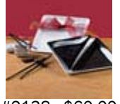
#2138 - $60.00 Asian Set for Two