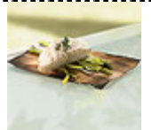
#2706 - $19.50 Grilling Planks