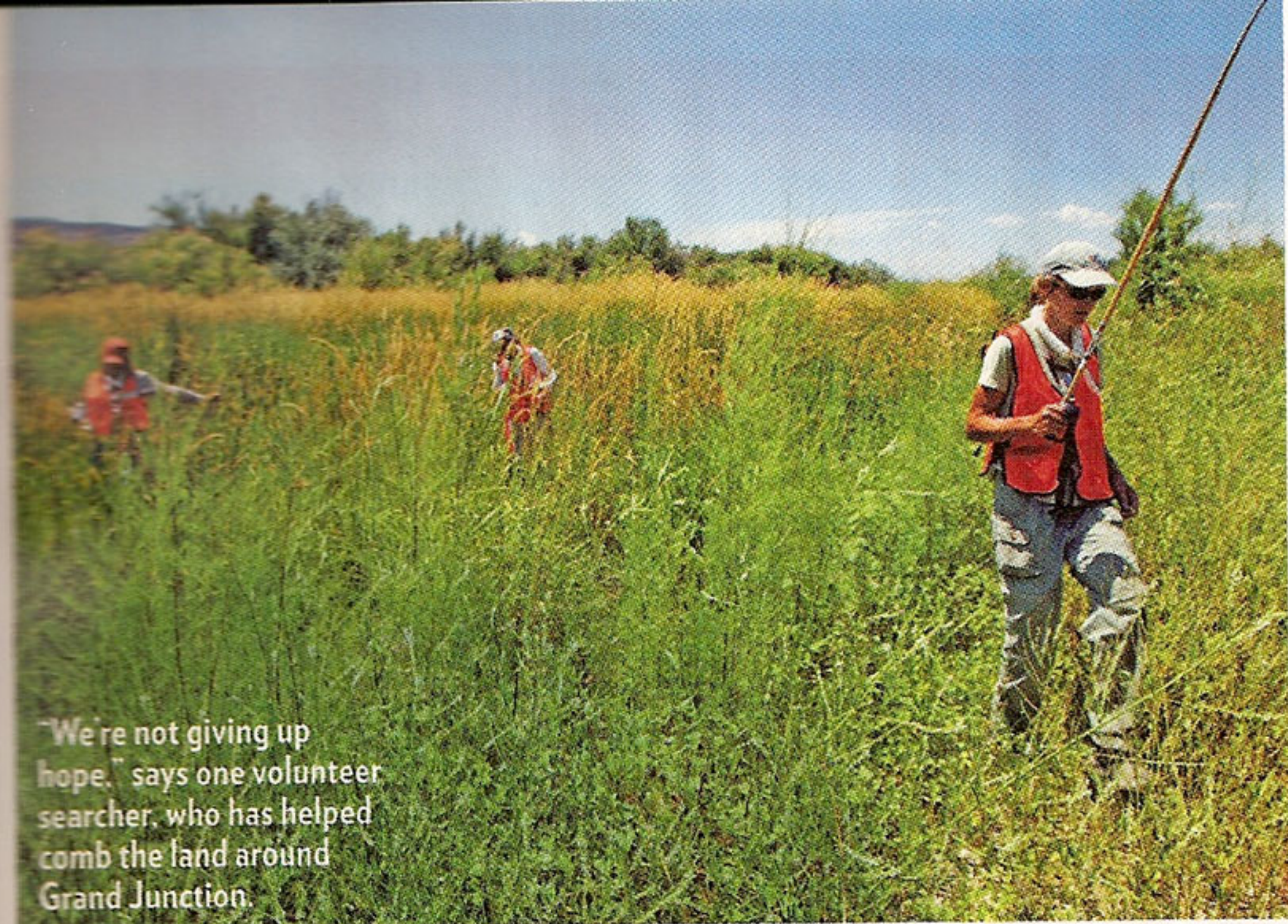
"We're not giving up hope," says one volunteer searcher, who has helped comb the land around Grand Junction.