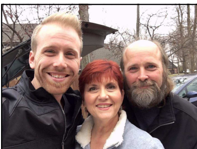
Our little family last year at Thanksgiving.