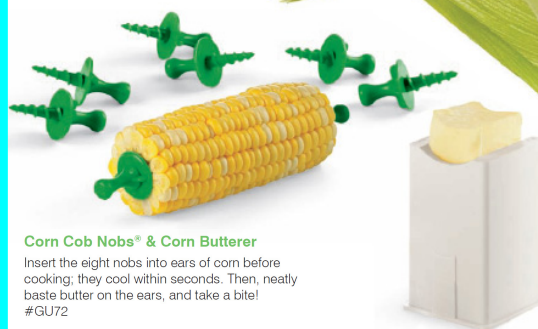
Corn Cob Nobs® & Corn Butterer Insert the eight nobs into ears of corn before cooking; they cool within seconds. Then, neatly taste butter on the ears, and take a bite! #GU72