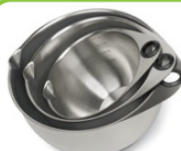
Includes 2 qts., 4 qts. & 6 qts.

When your guest sales total $650 or more, the Stainless Mixing Bowl Set is also one of your choices! Only $29.80! #HZ24