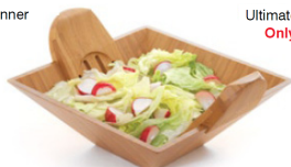
Large Bamboo Square Bowl & Bamboo Salad Claws Only $17.00! #HZ19