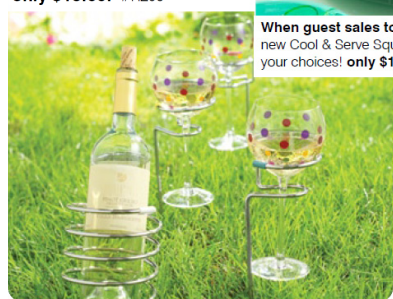
Outdoor Party Sticks (one bottle holder & six glass holders) only $15.60! #HZ06