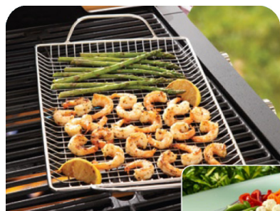
BBQ Grill Tray only $11.80! #HZ08

Host a Show in JUNE and save 60% on one of our favorite outdoor products!