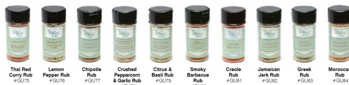
Thai Red Curry Rub #GU75