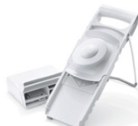
Ultimate Mandoline Only $23.80! #HZ20