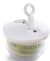
Salad & Berry Spinner Only $23.60! #HZ21

Host a Show in JULY and save 60% on one of our salad essentials!