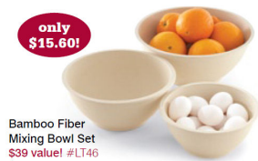
Bamboo Fiber Mixing Bowl Set $39 value! #LT46