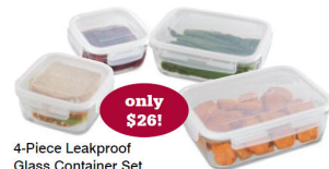
4-Piece Leakproof Glass Container Set $65 value! #LT45