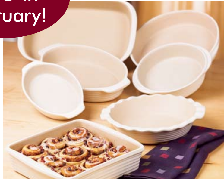
New Traditions™ French Vanilla Stoneware

Leave no stone unearned ... and at 60% off, why would you?