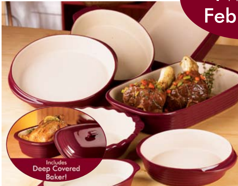
New Traditions™ Cranberry Stoneware