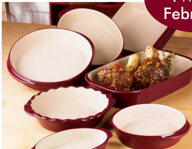
New Traditions™ Cranberry Stoneware Promotion excludes Deep Covered Baker