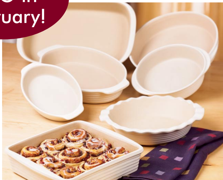
New Traditions™ French Vanilla Stoneware

Leave no stone unearned ... and at 60% off, why would you?