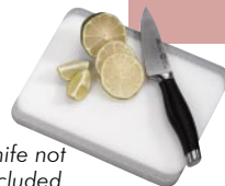
Knife not included.