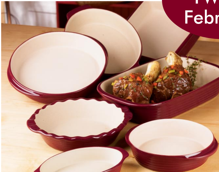
New Traditions® Cranberry Stoneware Promotion excludes Deep Covered Baker — Cranberry