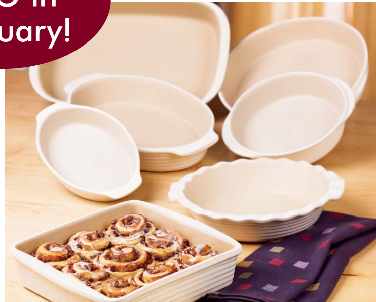
New Traditions® French Vanilla Stoneware

Leave no stone unearned ... and at 60% off, why would you?