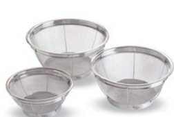
• Stainless Mesh Colanders Only $14! #HZ42

Just in time for the season's fresh fruits and veggies, you also can save 60% on your choice of one :