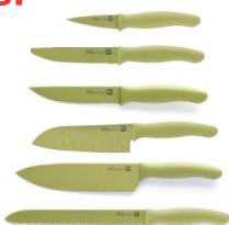
• Color Coated Knife Collection Paring, Tomato, Utility, Santoku, Chef's & Bread Knives Only $39.80! #HZ44