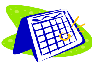
Calendar your Activities

This is a bookings diet! If you follow the plan you will get results-if you don't you won't. Keep on booking until you have all the shows you could possibly want on your calendar, whether it is 2 per week or 4 per week. Stay consistent and have FUN.