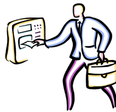
Take your check to the Bank