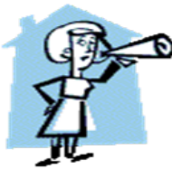
Tell the Benefits