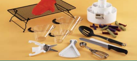
▲ $145.75 Value!