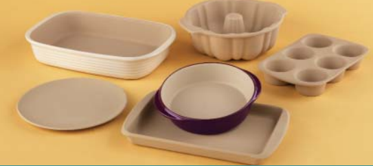
▲ $150.00 Value!