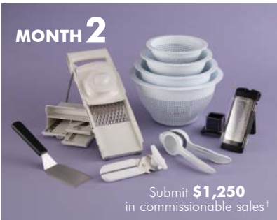
Submit $1,250 in commissionable sales†