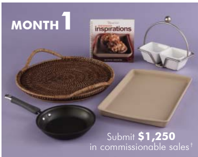
Submit $1,250 in commissionable sales†