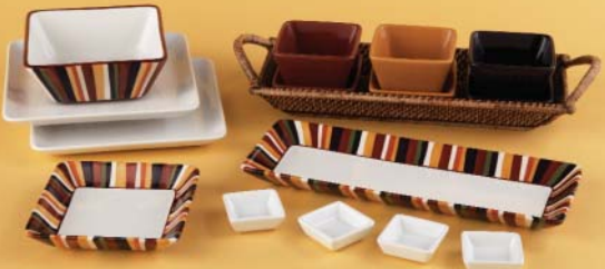
▲ $159.50 Value!