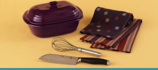
▲ $164.50 Value!