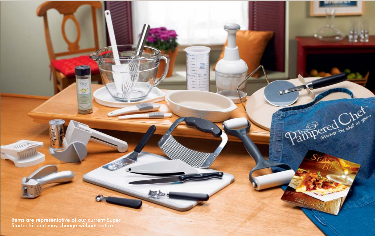
Items are representative of our current Super Starter kit and may change without notice.