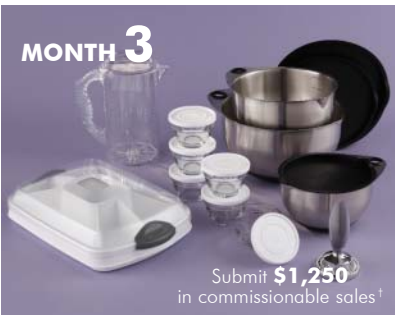
Submit $1,250 in commissionable sales†