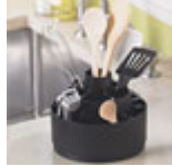
#2171 - $17.00 Tool Turnabout