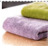
#2983/4 - $8.50 ea Microfiber Towel