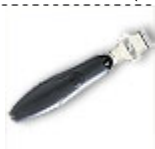
#1134 - $9.50 Zester/Scorer