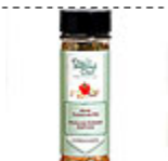
#9860 - $5.75 Asian Seasoning Mix