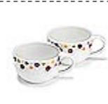
#1977 - $20.00 Dots Coffee & More Cups(2)