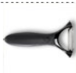
#1073 - $9.50 Julienne Peeler