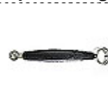
#1176 - $10.50 Core & More