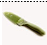
#1059 - $16.00 Color Coated Santoku Knife