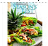
#1886 - $1.00 Season's Best Recipe Coll.