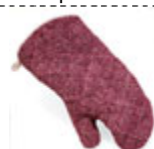
#1329 - $14.50 Oven Mitt