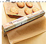
#1506 - $7.25 Parchment Paper