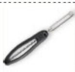
#1071 - $6.50 Vegetable Peeler