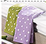
#2979 - $15.00 Dots Towel Set (of 2)