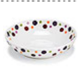
#2037 - $12.00 Dots Small Round Bowl