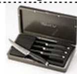
#1058 - $145.00 Forged Cutlery Stk Knife Set