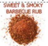
#9722 - $3.75 Sweet & Smoky BBQ Rub