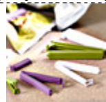
#2649 - $4.75 Twixit! Clip Combo Pack