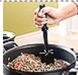
#2583 - $9.00 Mix 'N Chop