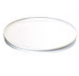
#2034 - $38.00 Large Round Platter