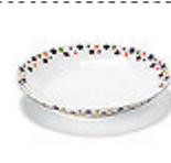
#2033 - $39.00 Dots Large Round Bowl