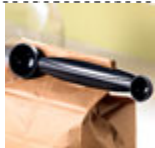
#2555 - $5.00 Scoop Clip