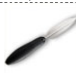
#1161 - $9.50 V-shaped Cutter