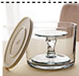
#2832 - $39.00 Trifle Bowl