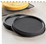
#1706 - $25.00 Torte Pan Set