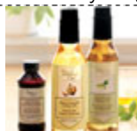
#9151 - $10.50 Garlic-Infused Canola Oil