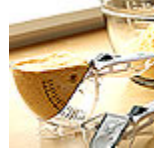
#2228 - $15.50 Easy Adj. Measuring Cup