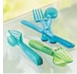
#2827 - $15.00 Outdoor Utensil Set