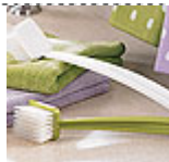
#1628 - $8.50 Easy Clean Kitchen Brush