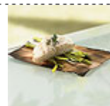
#2706 - $19.50 Grilling Planks