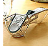
#2229 - $12.00 Easy Adj. Measuring Spoon