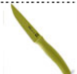
#1064 - $14.00 Color Coated Tomato Knife