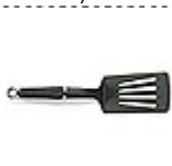
#2347 - $11.00 Small Slotted Turner