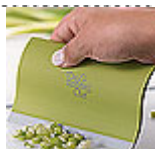
#1617 - $6.00 Handy Scraper