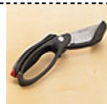
#2582 - $25.00 Salad Chopper