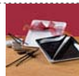
#2138 - $60.00 Asian Set for Two