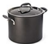
#2873 - $195.00 Executive 12 Qt. Stockpot