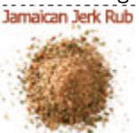
#9812 - $3.75 Jamaican Jerk Rub