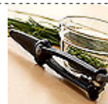
#1077 - $15.50 Kitchen Shears