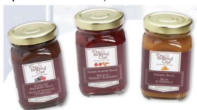
Chocolate Raspberry Sauce Cherry Almond Sauce Caramel Sauce

As a December guest, choose one dessert sauce FREE with purchase of $60 or more