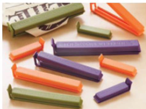
Twixit! Clip Combo Pack

Set of ten #2652 $5.50 Sage, pumpkin and eggplant.