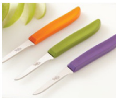
Quikut Paring Knives

Set of three #1259 $4.75 Pumpkin, sage, and eggplant.