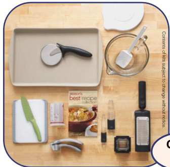
NEW CONSULTANT MINI KIT

Both kits include everything you need to start your business. JOIN TODAY!