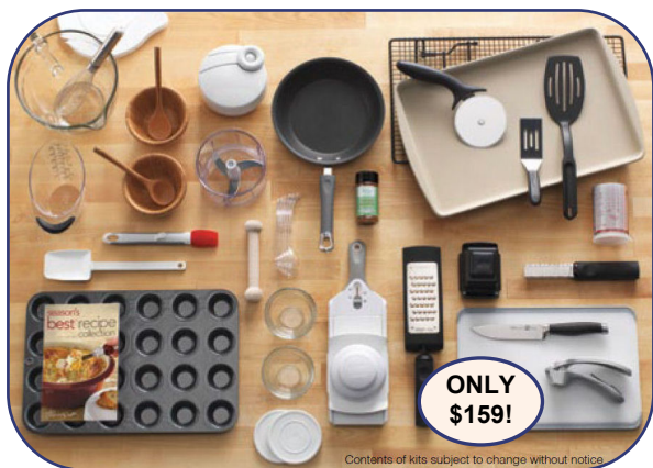
NEW CONSULTANT KIT