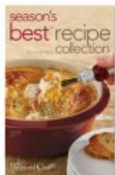
Season's Best F/W Cookbook #1959 = $2.00