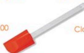
Classic Scraper #1658 = $11.50