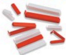
Twixit Clip Combo Pack #2653 = $6.00