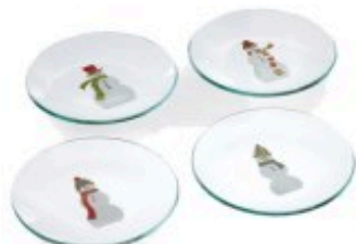
Snowmen Appetizer Plates #3011 = $22.00