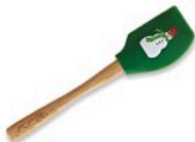
Snowman Scraper #2399 = $8.00