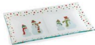
Snowmen Divided Platter #3012 = $24.00