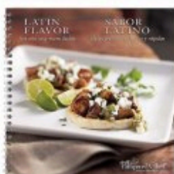
Latin Flavor Cookbook #1907 = $10.00