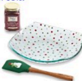
Holiday Entertaining Set #2404 = $39.00