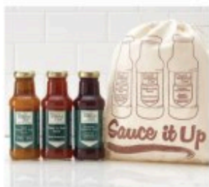
BBQ Sauce it Up Set #2386 = $34.50