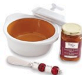
Serve it Hot Set #2411 = $45.00