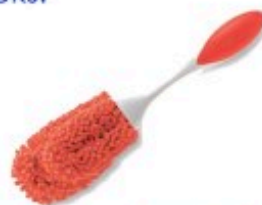
Glass Cleaning Brush #1649 = $9.00