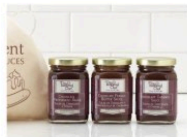
Decadent Dessert Sauces #2387 = $28.50