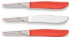
3 Quikut Paring Knives #1262 = $5.50