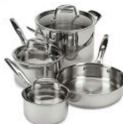
7-Piece Stainless Steel Cookware Set #2877 = $520.00