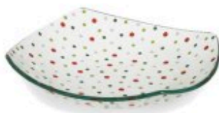
Dots Square Bowl #3010 = $24.00