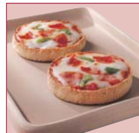
Pronto Mini Pizzas, Small Bar Pan Use and Care