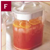
PAGE 19 F. Perfect Party Punch, Family-Size Quick-Stir® Pitcher Use and Care