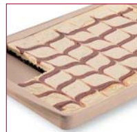
Marble Cheesecake Squares*