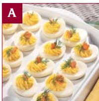
PAGE 18 A. Delicious Deviled Eggs, Rectangle Server Use and Care