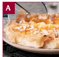
PAGE 24 A. Phyllo Cheesecake Tart, Season's Best® fall/winter 2005 p. 25