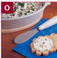
O. Three-Cheese Walnut Spread, Spreader Use and Care