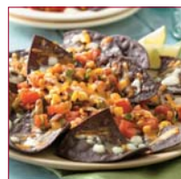
PAGE 23 Easy Nachos for Two, Stoneware Inspirations cookbook p. 101