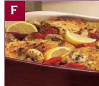
F. Lemon Greek Chicken, Stoneware Sensations cookbook p. 64