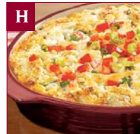
H. Hot Artichoke & Crabmeat Dip, Celebrate! cookbook p. 12