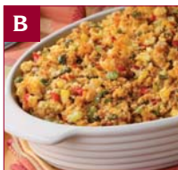
B. Chorizo Cornbread Stuffing, Turkey Basics Recipe Card Collection