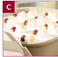
C. Citrus Striped Angel Cake, Delightful Desserts cookbook p. 11