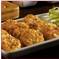
Sizzling Coconut Shrimp Cakes with assorted sauces, Season's Best® fall/winter 2005 and Celebrations Dim Sum & Then Some