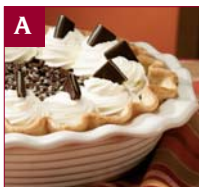
PAGE 20 A. Mint Chocolate Silk Pie, Easy Pies & Tarts Recipe Card Collection