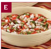
E. Create-a-Party Dip, Crab Rangoon, Stoneware Inspirations cookbook p. 21