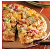
PAGE 22 Chinese Chicken Pizza, Stoneware Inspirations cookbook p. 31