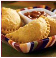
Empanadas de Pollo, Una Muestra de The Pampered Chef fall/winter 2005 p. 2