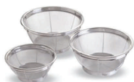
• Stainless Mesh Colanders Only $14! #HZ42

Just in time for the season's fresh fruits and veggies, you also can save 60% on your choice of one :