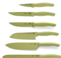
• Color Coated Knife Collection Paring, Tomato, Utility, Santoku, Chef's & Bread Knives Only $39.80! #HZ44

As a host, you always enjoy: • FREE products of your choice. • Half-price and discounted products. • 10% discount for a year. • FREE shipping on your order.