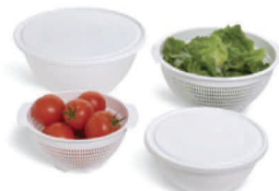
• Colander & Bowl Set Only $15.60! #HZ43